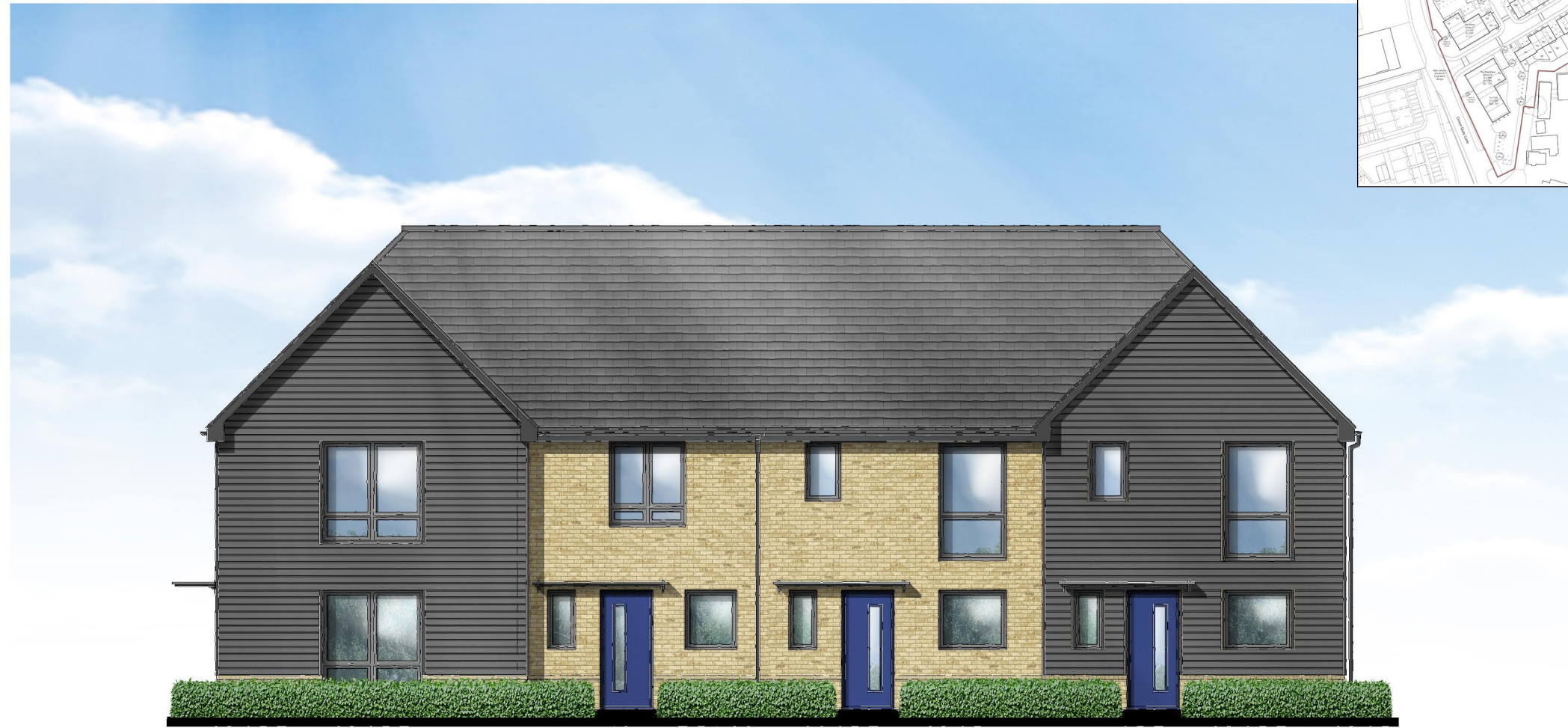
The Blemmere Plot 80